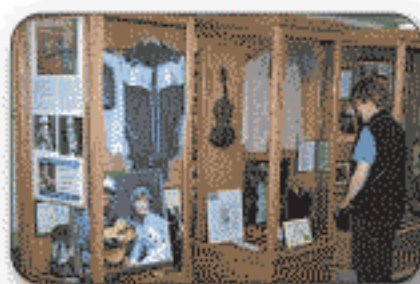
THE BARN DANCE HISTORICAL SOCIETY ENTERTAINMENT MUSEUM http://www.thebardance.ca

Download Itineraries at www.blythfestival.com