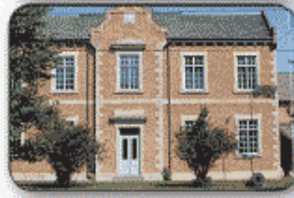
THE HURON COUNTY MUSEUM http://www.huroncounty.ca/museum

The Huron Historic Gaol is a unique and imposing octagonal building which served as the County Jail from its opening in 1842 until 1972 when all inmates were transferred to regional facilities. The Gaol is a designated National Historic Site, a one-of-a-kind experience.