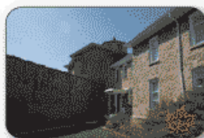
THE HURON HISTORIC GAOL http://www.huroncounty.ca/museum

The North Huron Museum is a community museum with special exhibits, art and innovative events. Writers are invited to practice their craft in our Alice Munro nook, overlooking the Alice Munro Literary Garden..